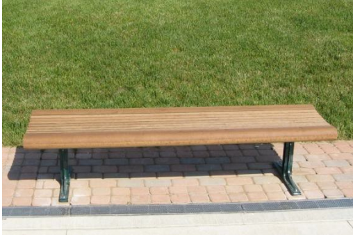
Gretchen Backless Bench