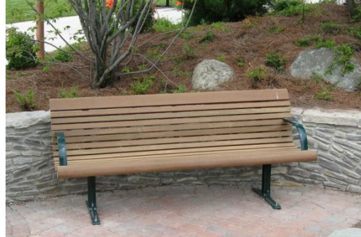
Gretchen Backed Bench

The cost for the benches is subject to change. Please contact us for up to date pricing information. Prices include the bench, plaque, engraving, and shipping costs. The City installs and maintains the benches free of charge.