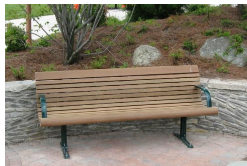
Gretchen Backed Bench