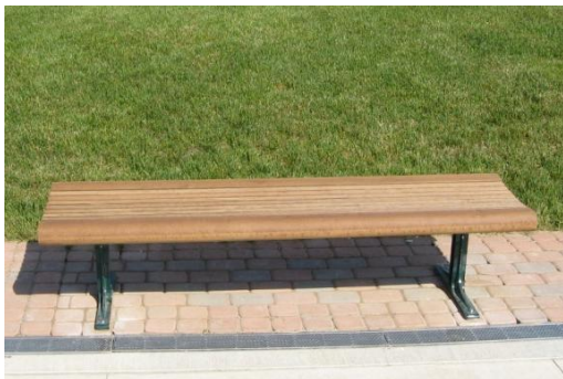
Gretchen Backless Bench

The City has selected the Gretchen bench offered by Landscape Forms of Kalamazoo, Michigan as the preferred bench type used for this program. Two styles of benches are available for purchase- a backless bench and a backed bench.